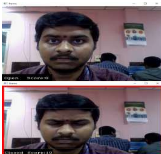
Figure02a. 2b: Open CV window of the drowsiness detection system when eyes are opened and closed.

This GUI is the first one to appear to show that the application's initial sequence has been successfully initiated and the good to go. The results of the project are taken a snapshot as below: