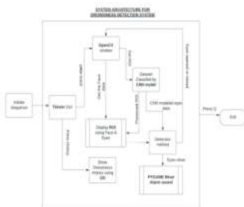
Figure 01: System architecture of the drowsiness detection system

The system architecture consists of the entire project’s operational modules as dataset, cascade file, model.py, drowsiness detection.py etc. The initial sequence of the project will begin when user clicks in the application in his working directory. Then the GUI in the system architecture will be initialized. Then it will proceed with the second stage in the architecture i.e., process initiation at front end.